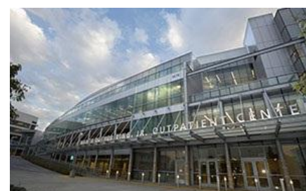
New MLK Outpatient Center Opening Spring 2014