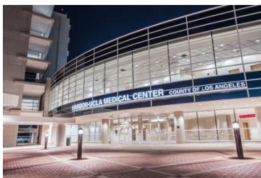
New ER and OR at Harbor/UCLA Medical Center Opening 2014